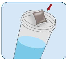
Drop Sol-U-Pak into cold water