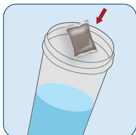
Drop Sol-U-Pak into cold water

It's as simple as dropping a Sol-U-Pak ™ into a shaker bottle with cold water, shaking to dissolve, then drinking! The Sol-U-Pak only takes about 10 seconds to dissolve.