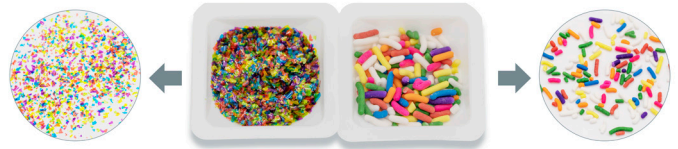
0.15g of EdiSparklz vs. 3g of sprinkles

on the right contains sprinkles. The weighboat with EdiSparklz only weighs 0.15g while the weighboat with sprinkles weighs a whopping 3g!